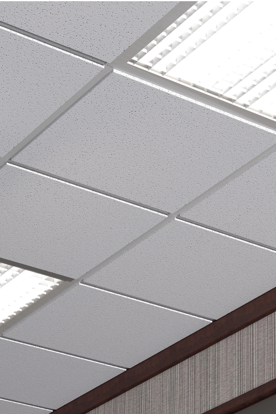
USG Radar™ Basic R2120